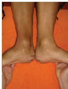
Client After Treatment