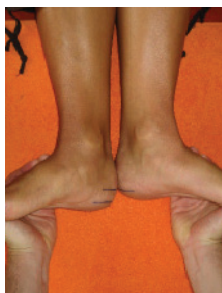
Client Before Treatment

When the Energetic Alignment is combined with acupressure to address constricted muscles and trigger points, a few more appointments may be recommended to ensure the muscles “unlearn” their position when pain is present.